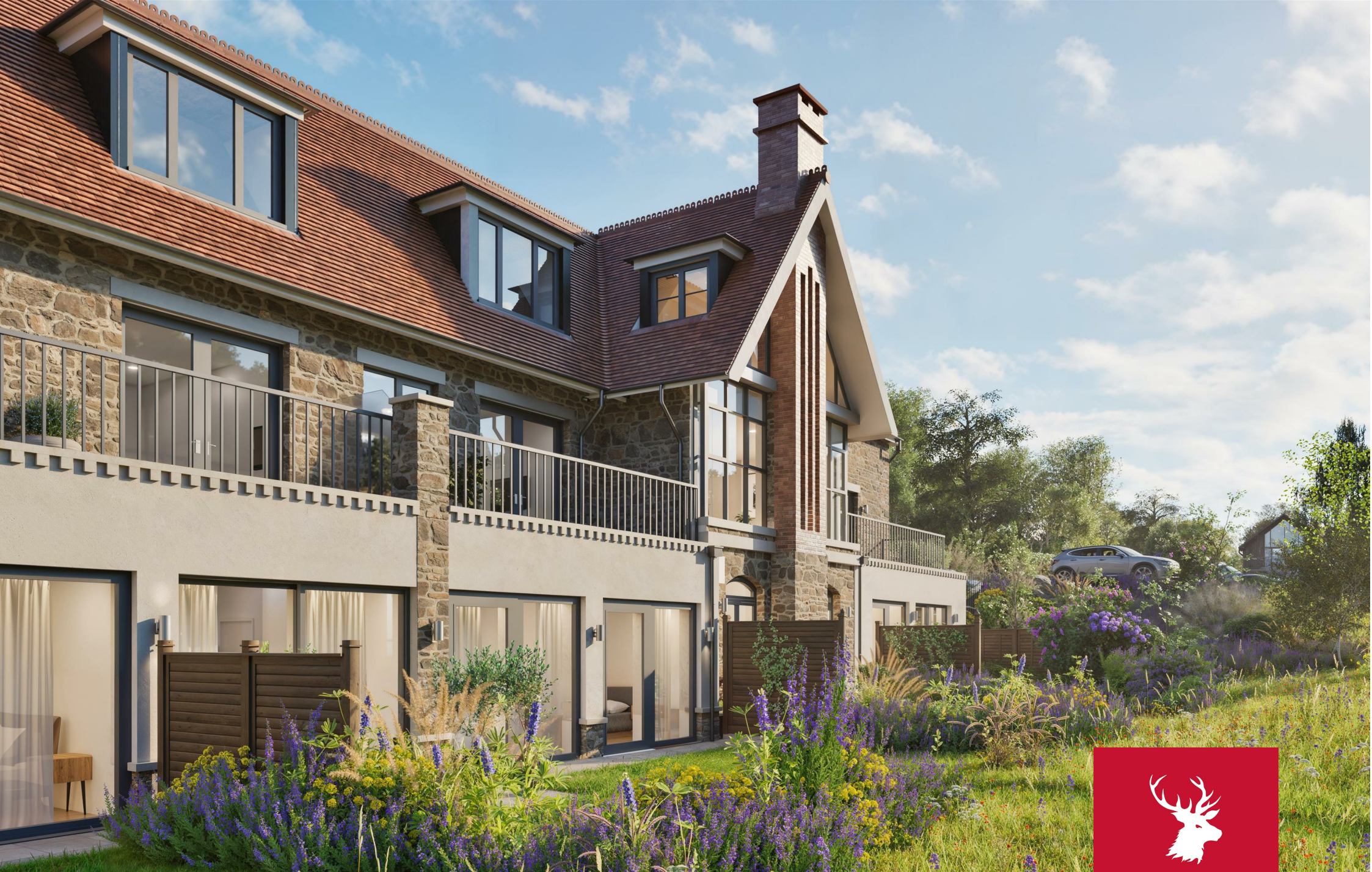
Apartment 3, Lee Bay Gardens