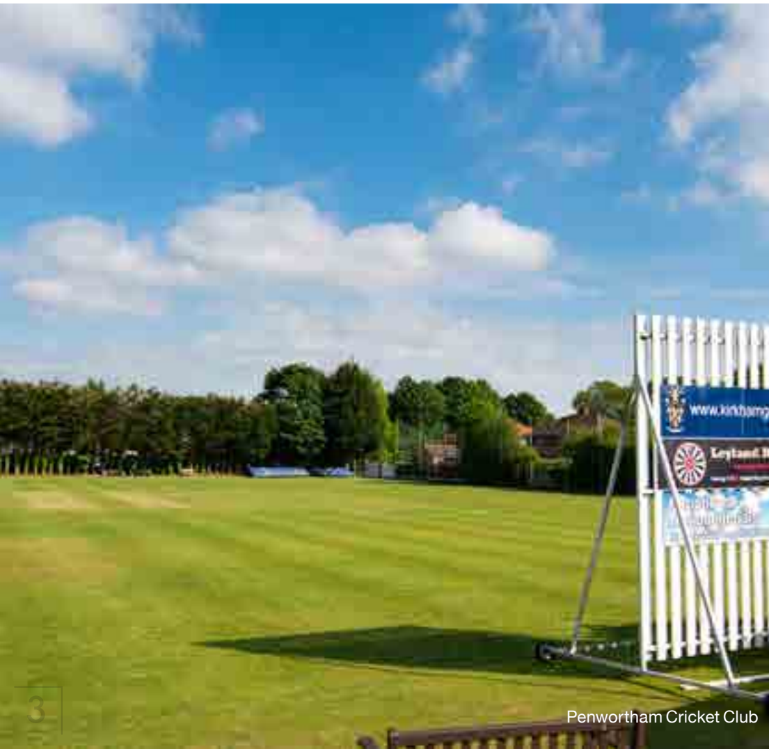
Penwortham Cricket Club

There are plenty of local attractions close to Penwortham, including Hurst Grange Park, City Church Preston, Turbary Woods Owl and Bird Sanctuary, Lancashire Infantry Museum, and the Ribble Steam Railway to name but a few. Residents will find plenty of things to do to suit any taste or age group, from young grandchildren to friends old and new. There are regular bus services from Penwortham to surrounding towns, villages and cities, including Southport, Ormskirk, Bent Bridge, Preston, Liverpool and Blackpool. There is a bus stop located on Cop Lane, under 400 feet from the development.