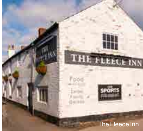
The Fleece Inn

A vibrant community in the heart of Penwortham