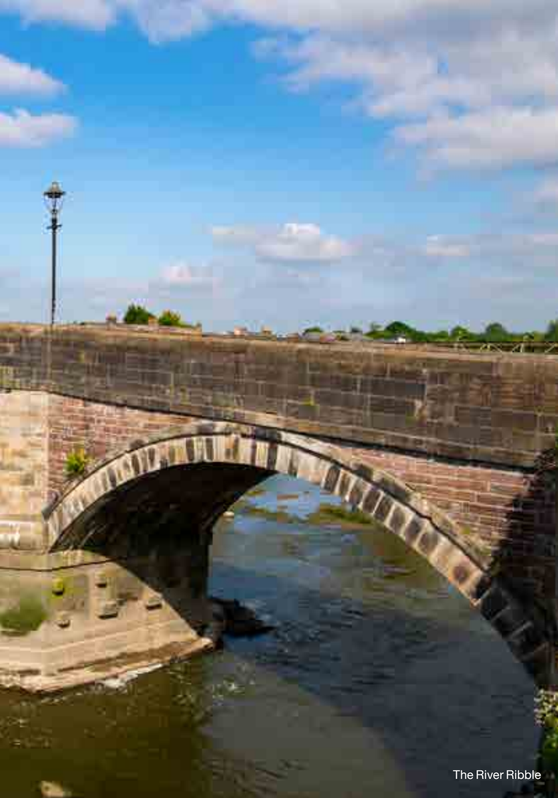
The River Ribble

Join 13 years of happy homeowners when you buy with McCarthy & Stone