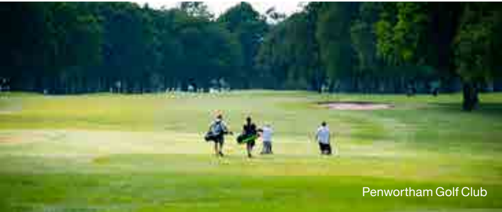
Penwortham Golf Club