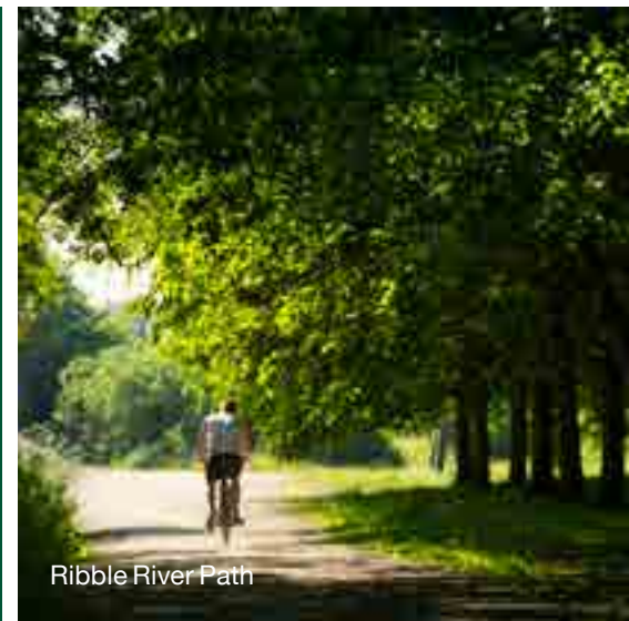
Ribble River Path

Keeping you close to the things that really matter