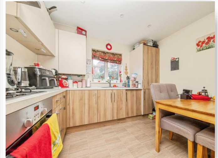
Meridian Rise, Ipswich, IP4 2GF