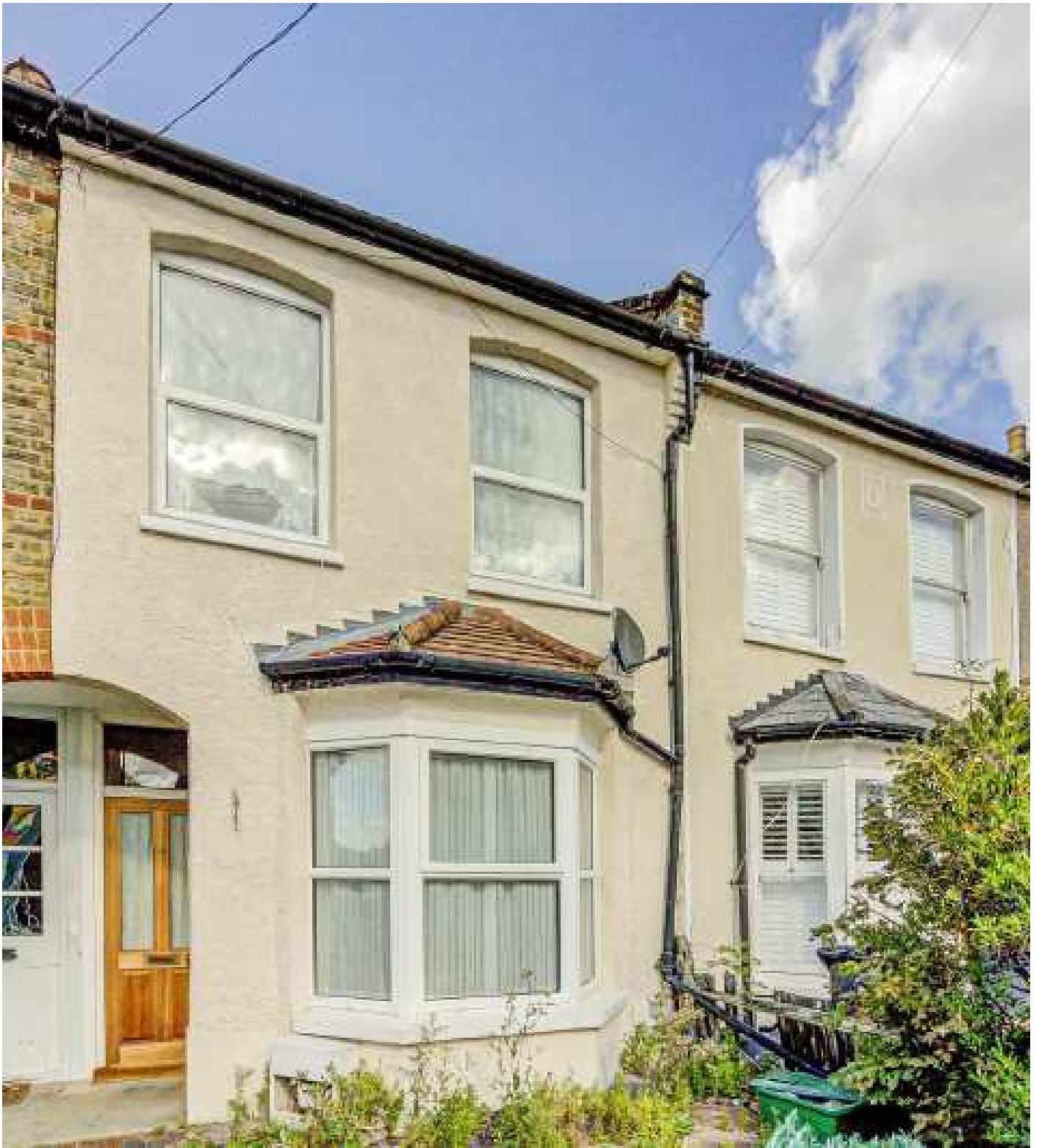
Ronver Road, SE12 £419,000