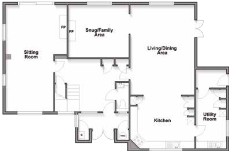
Ground Floor Approx. 127.6 sq. metres (1373.2 sq. feet)