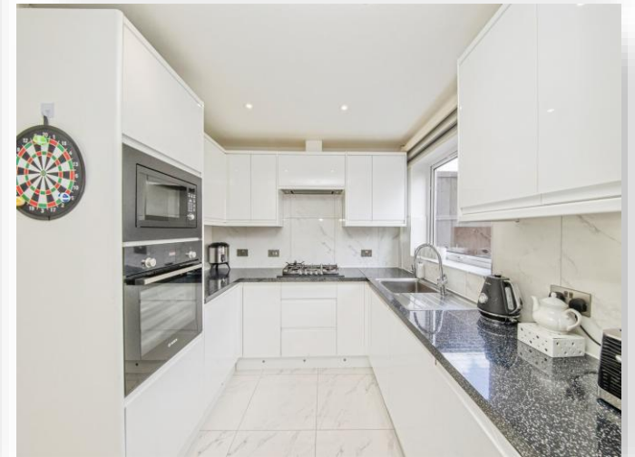
Weaver Close, Ipswich, IP1 5RB