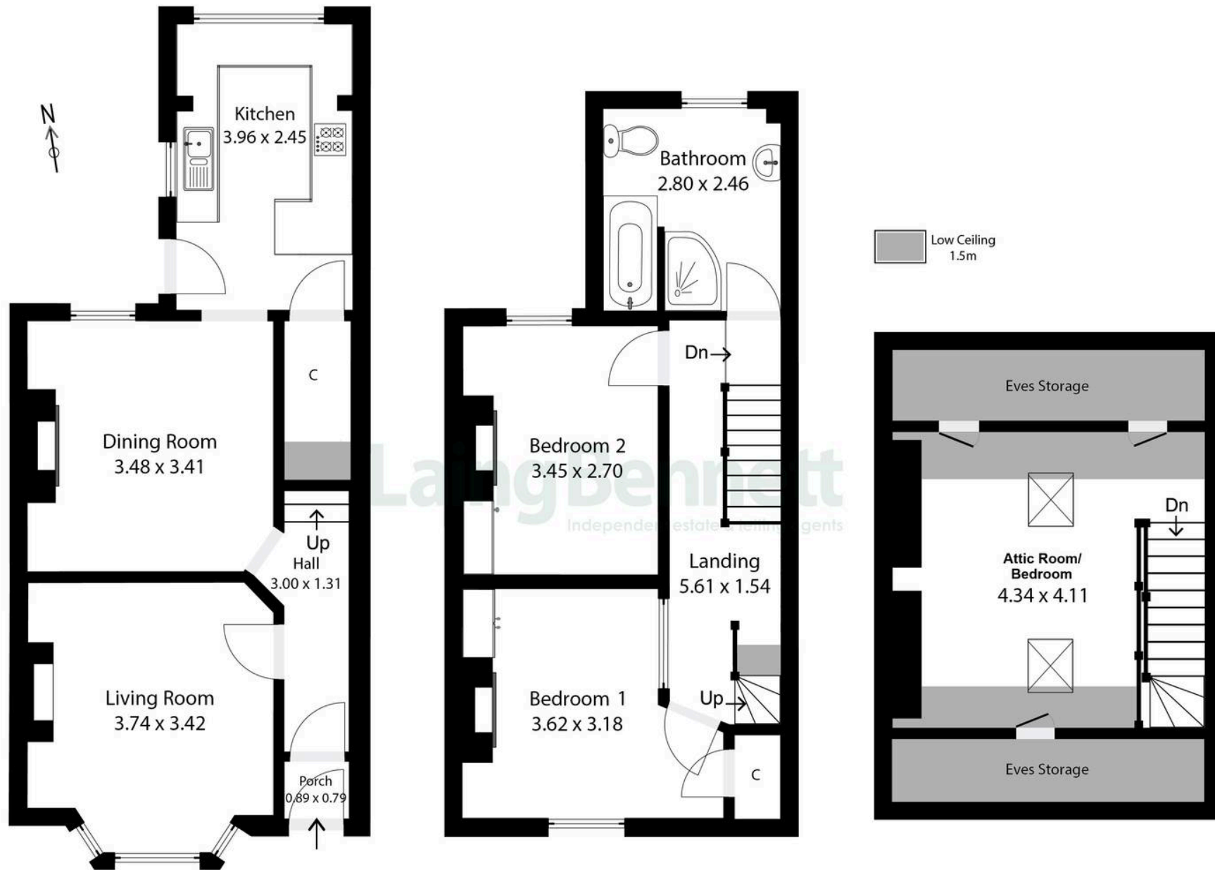
Illustration for Identification purposes only. Measurements are approximate. Dimensions given are between the widest points. Not to scale. Outbuildings are not shown in actual location.

Approximate Gross Internal Area = 106 sq m / 1141 sq ft