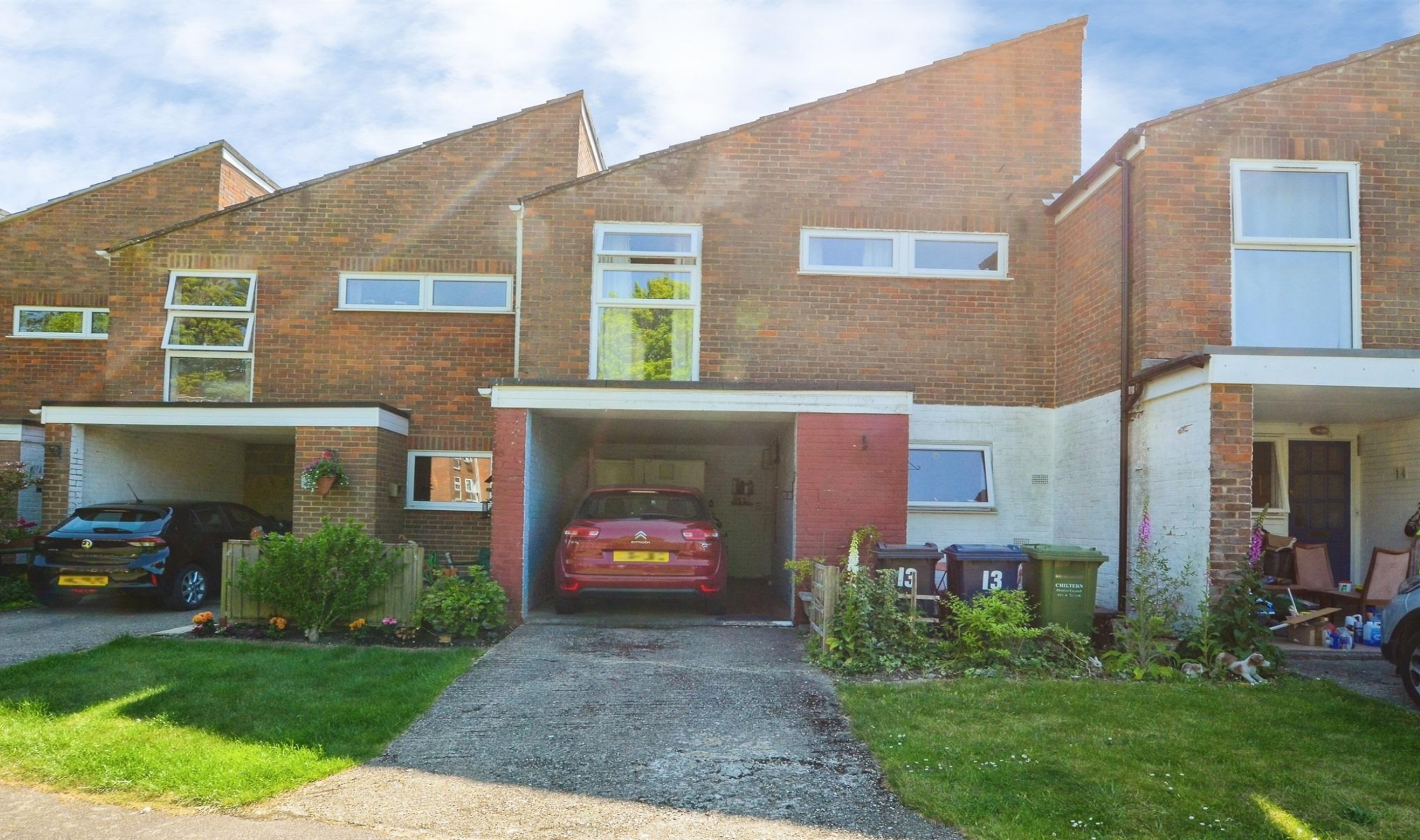
Meades Lane, Chesham HP5 1ND