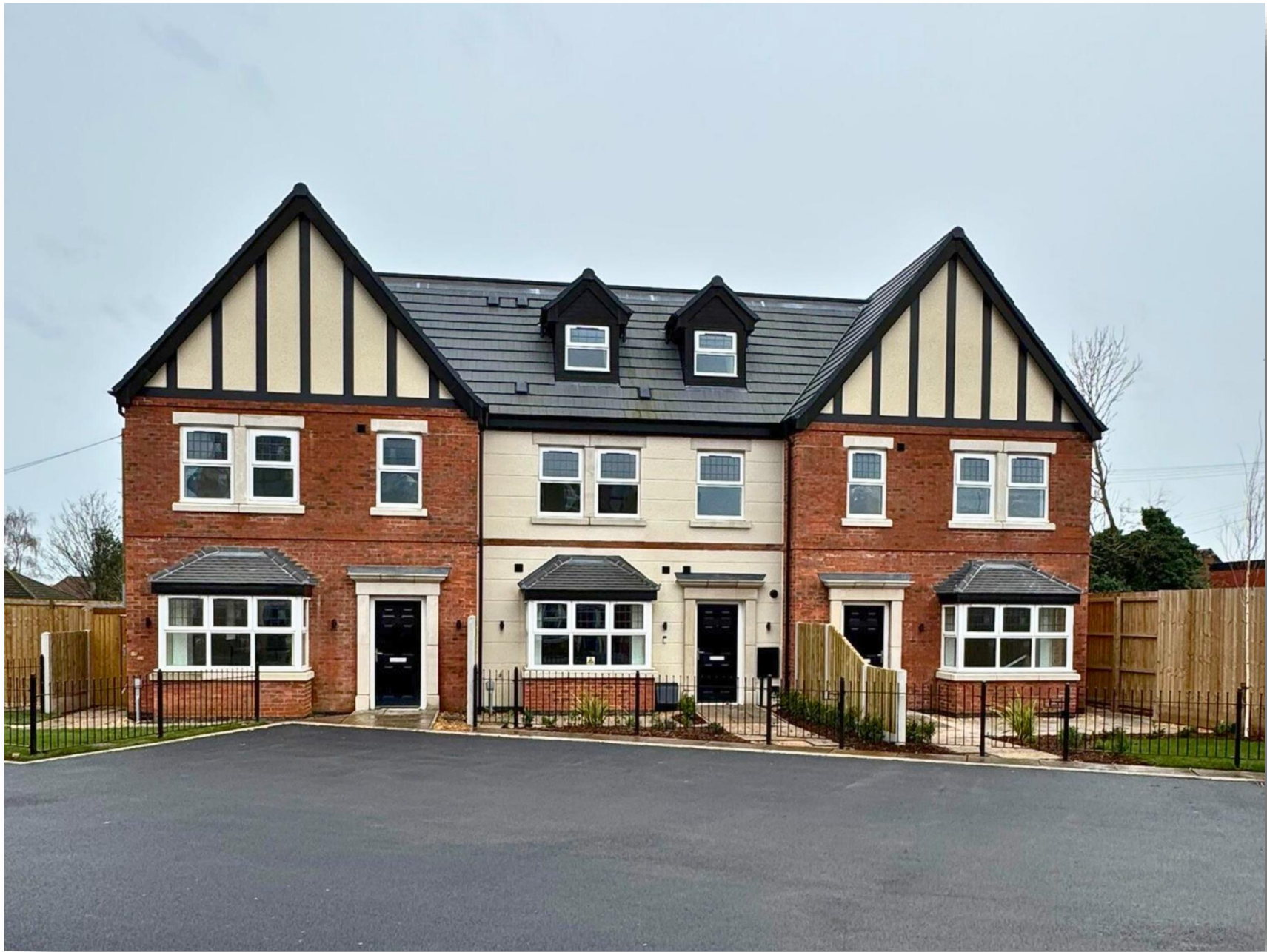
Willoughby Gardens Bridge Road, Wollaton Nottingham NG8 2DG