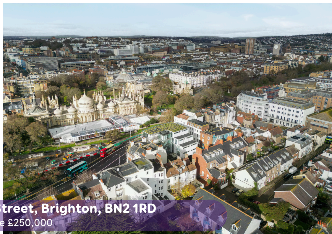
Glass Pavilion, Princes Street, Brighton, BN2 1RD Asking Price £250,000