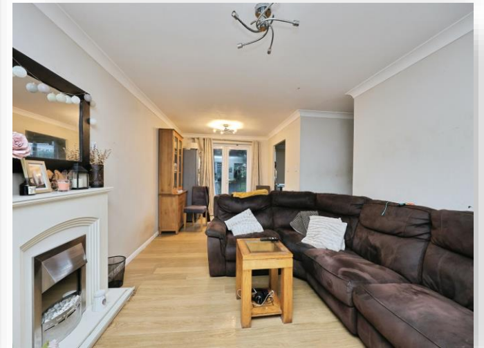
Violet Way, Dereham NR19 2UR