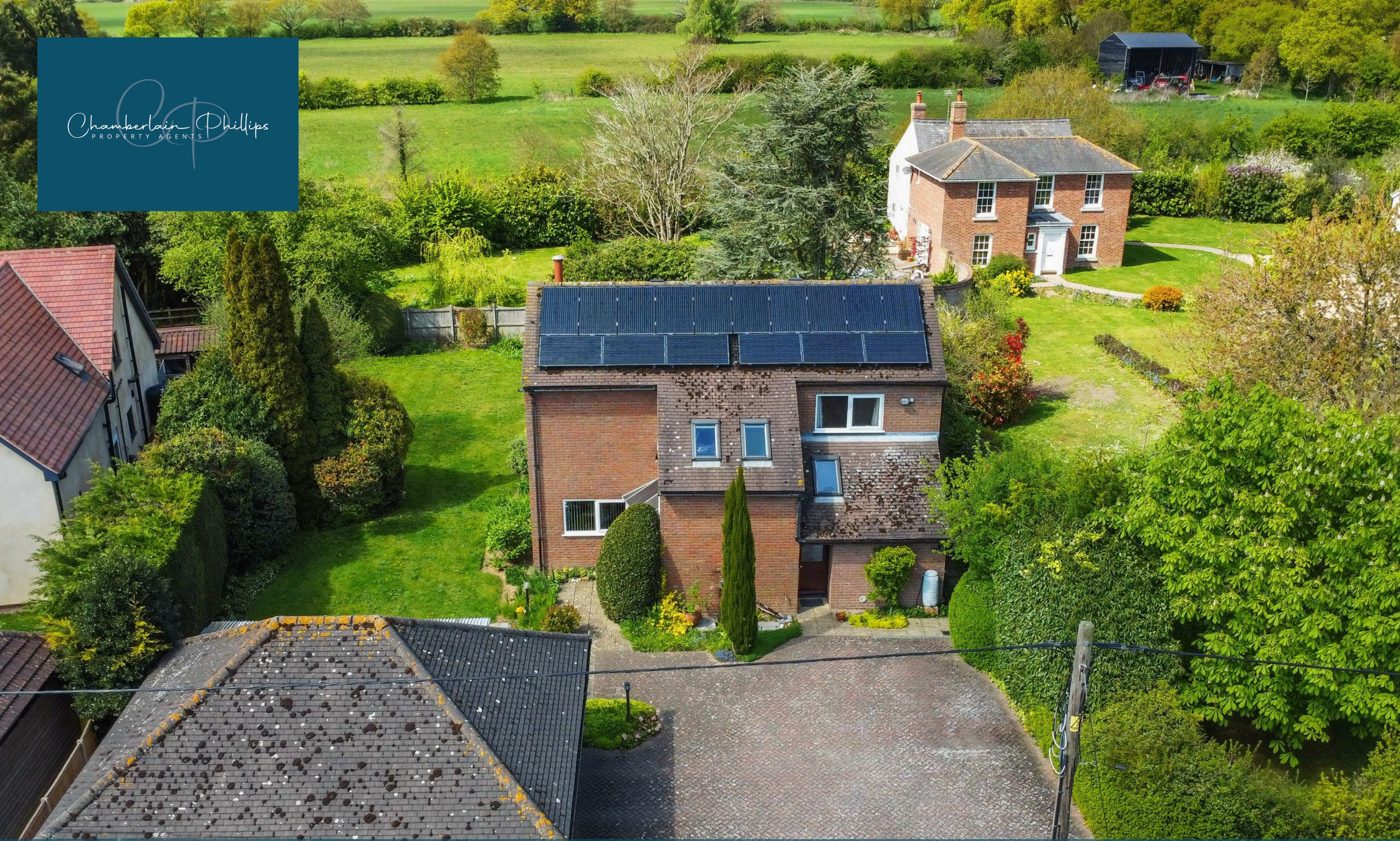
Frating Road, Great Bromley