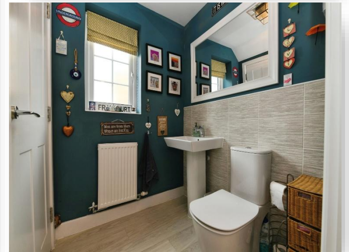
Westons Piece, DEVIZES SN10 2GJ