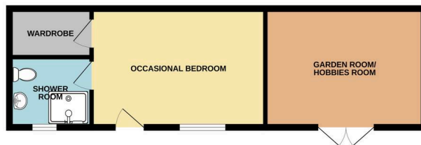
EXTERNAL 387 sq.ft. (36.0 sq.m.) approx.

Whilst every attempt has been made to ensure the accuracy of the floorplan contained here, measurements of doors, windows, rooms and any other items are approximate and no responsibility is taken for any error, omission or mis-statement. This plan is for illustrative purposes only and should be used as such by any prospective purchaser. The services, systems and appliances shown have not been tested and no guarantee as to their operability or efficiency can be given. Made with Metropix ©2026