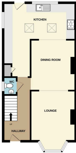
GROUND FLOOR 584 sq.ft. (54.2 sq.m.) approx.