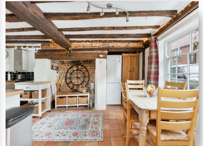
The Beams King Street, New Buckenham Norwich NR16 2AF