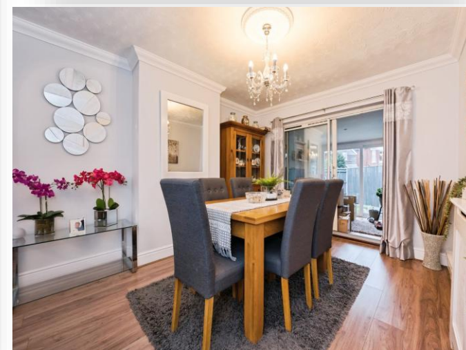
Jameson Road, Southampton SO19 2HY