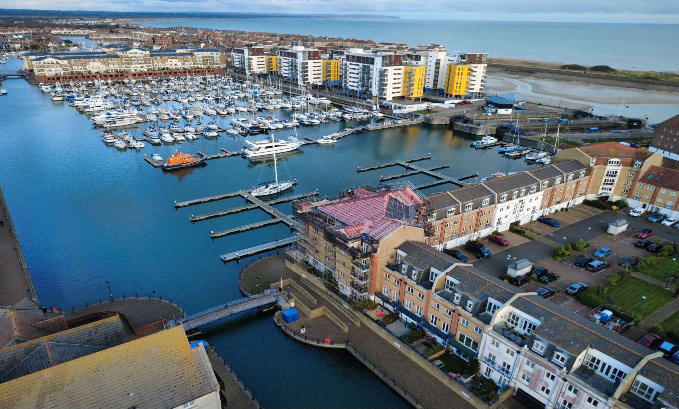
The Piazza, Eastbourne BN23 5TG