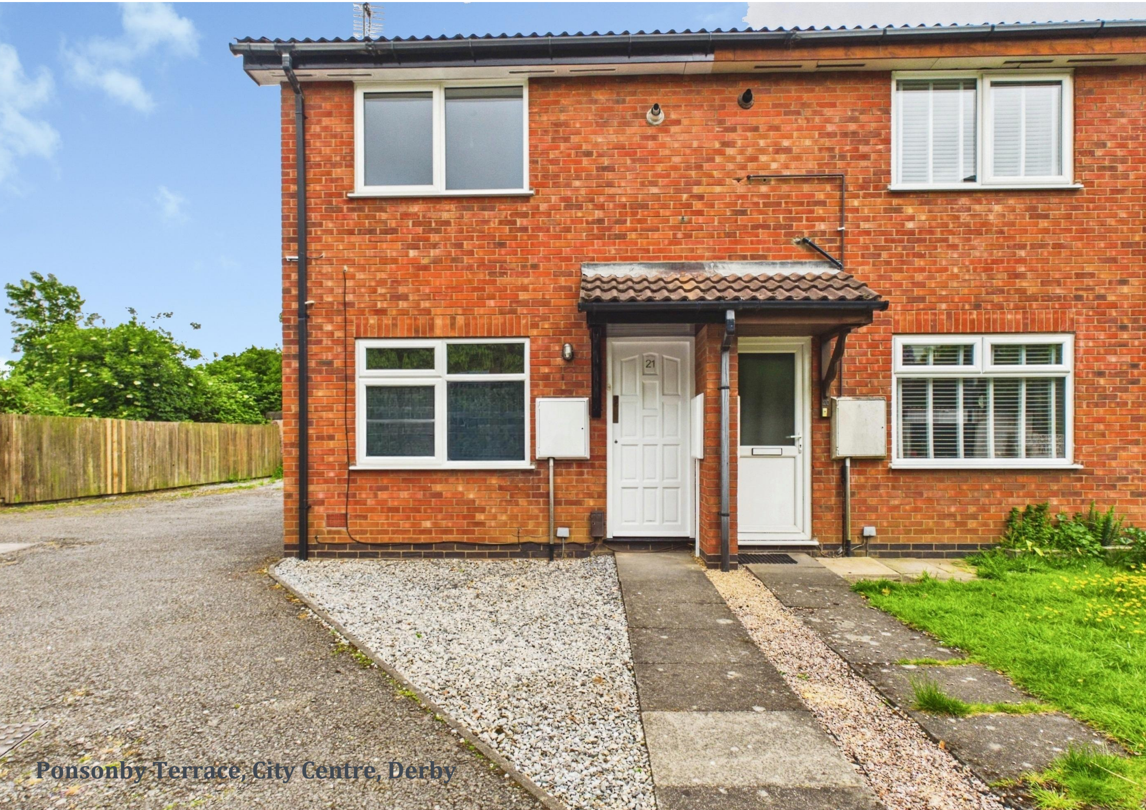
Ponsonby Terrace, City Centre, Derby