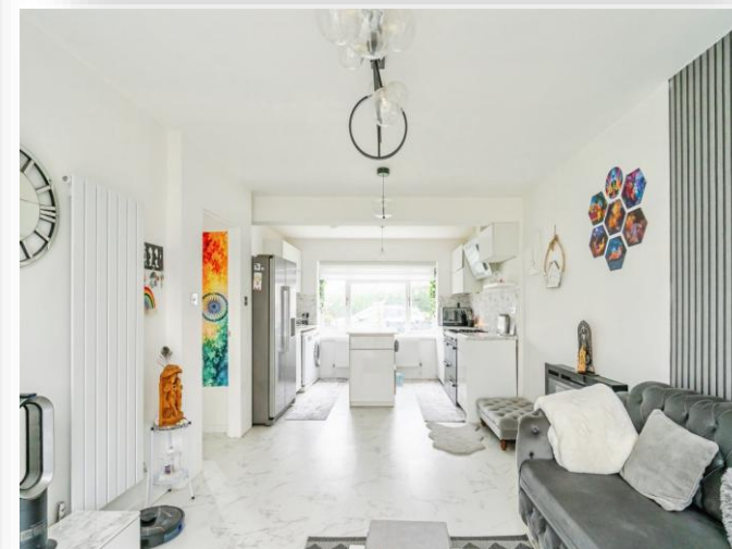
Ivy Close, Westergate CHICHESTER PO20 3RF