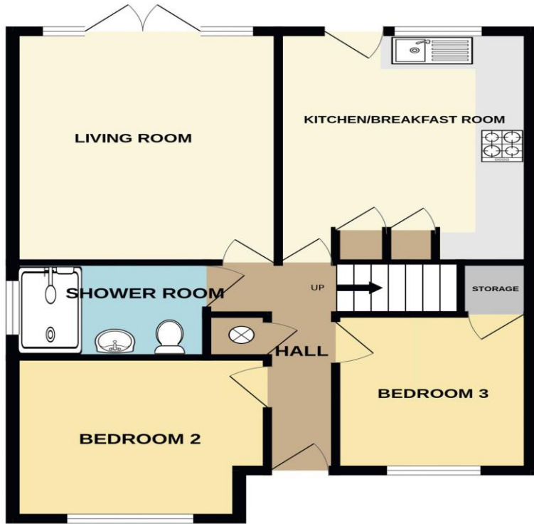
GROUND FLOOR 622 sq.ft. (57.7 sq.m.) approx.