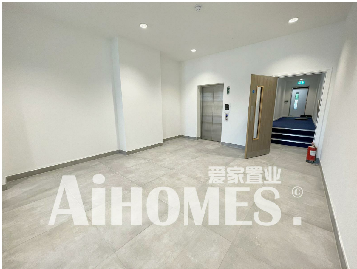
Modern 2B2B Apartment | Valiant House | Altrincham WA141 73730VH