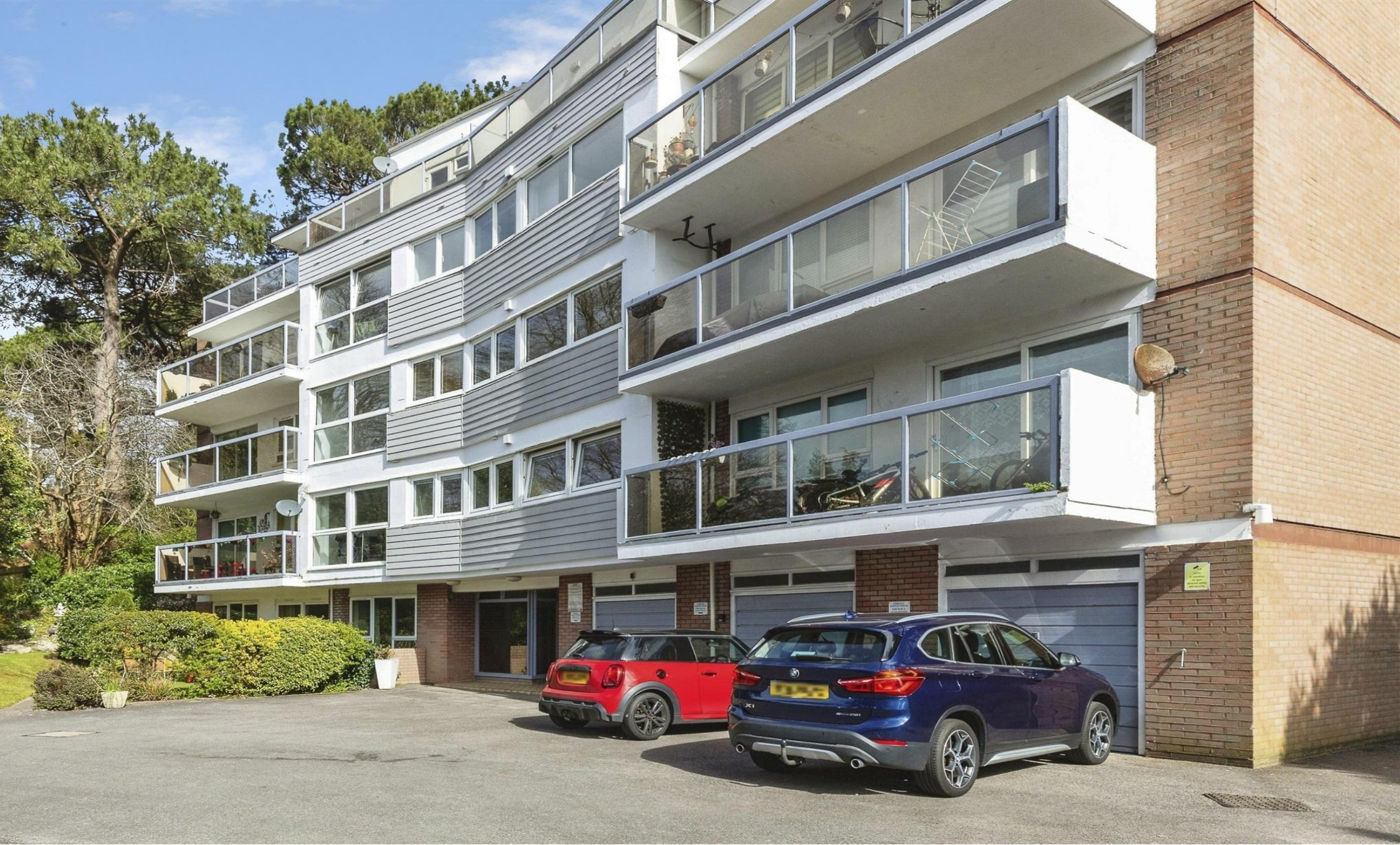
The Grange Branksome Wood Road, Bournemouth BH2 6BT