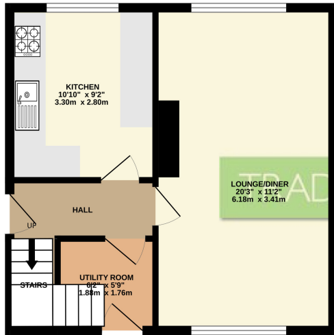
1ST FLOOR 399 sq.ft. (37.1 sq.m.) approx.