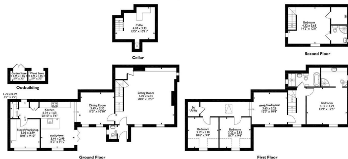
Please note that the location of doors, windows and other items are approximate and this floorplan is to be used for illustrative purposes only. Unauthorized reproduction is prohibited.

Approximate Gross Internal Area Main House = 187 Sq M/2014 Sq Ft Outbuilding = 13 Sq M/140 Sq Ft Total = 200 Sq M/2154 Sq Ft