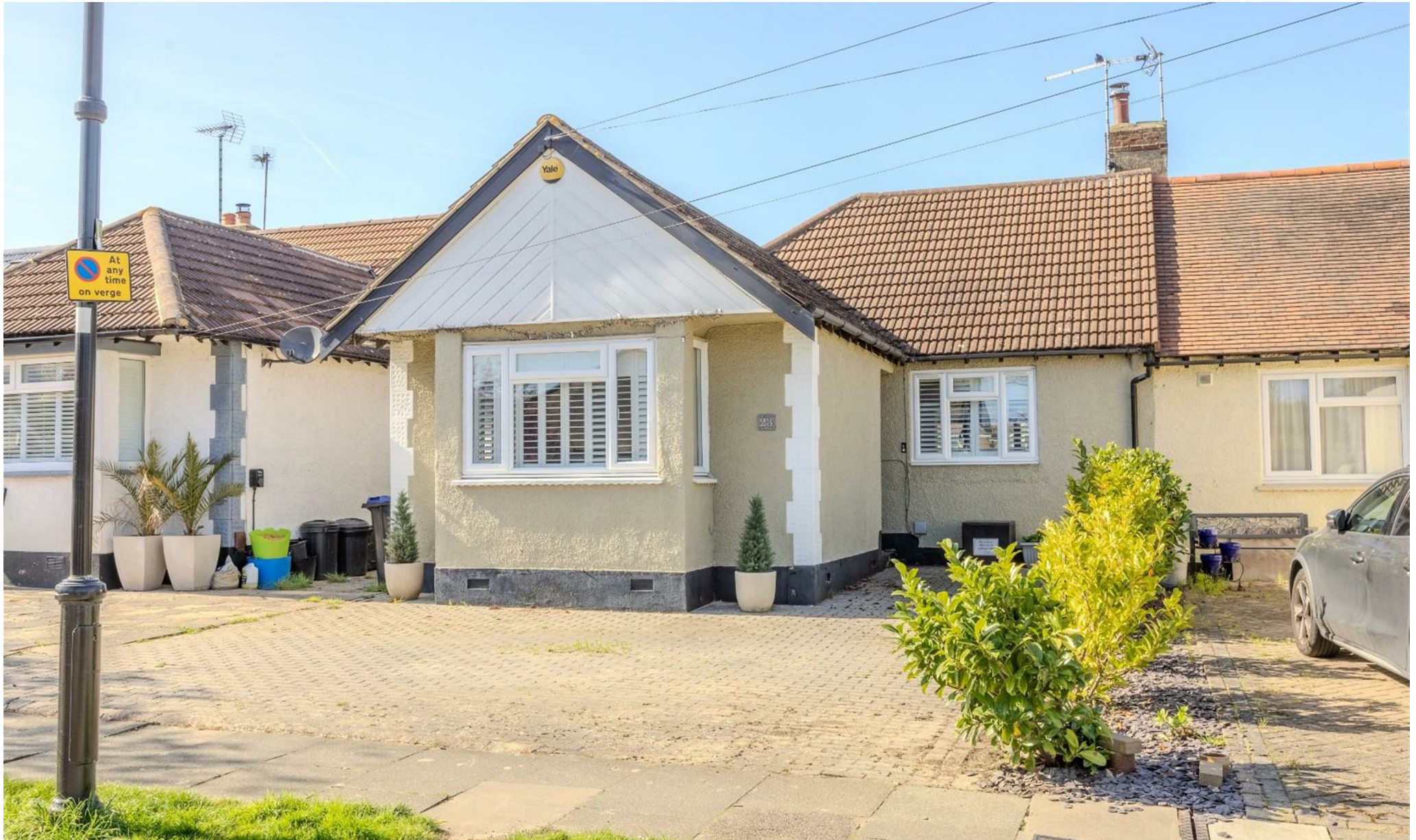
Vardon Drive, Leigh-On-Sea £595,000