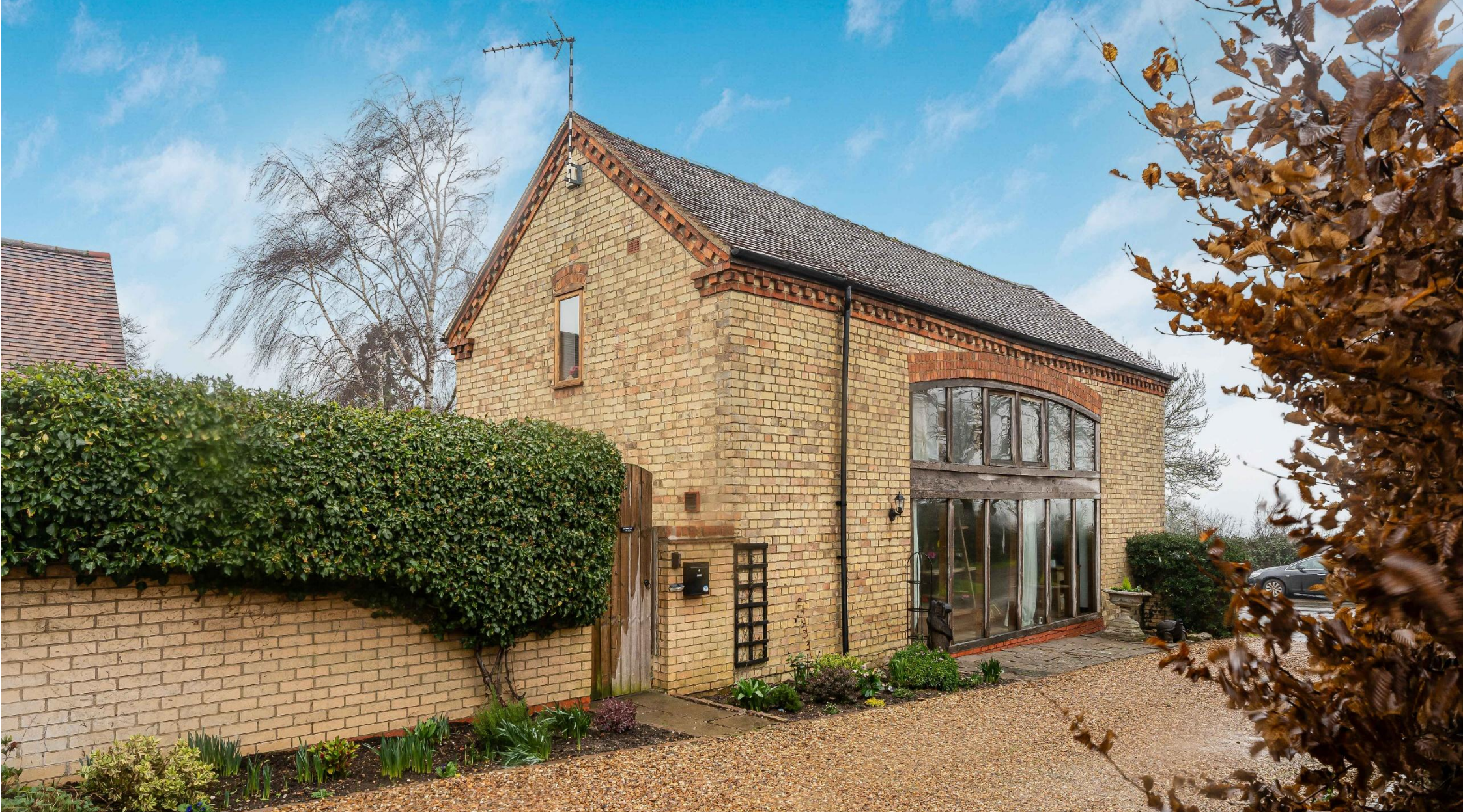
The Old Coach House, Flecknoe, Warwickshire, CV23 8AT