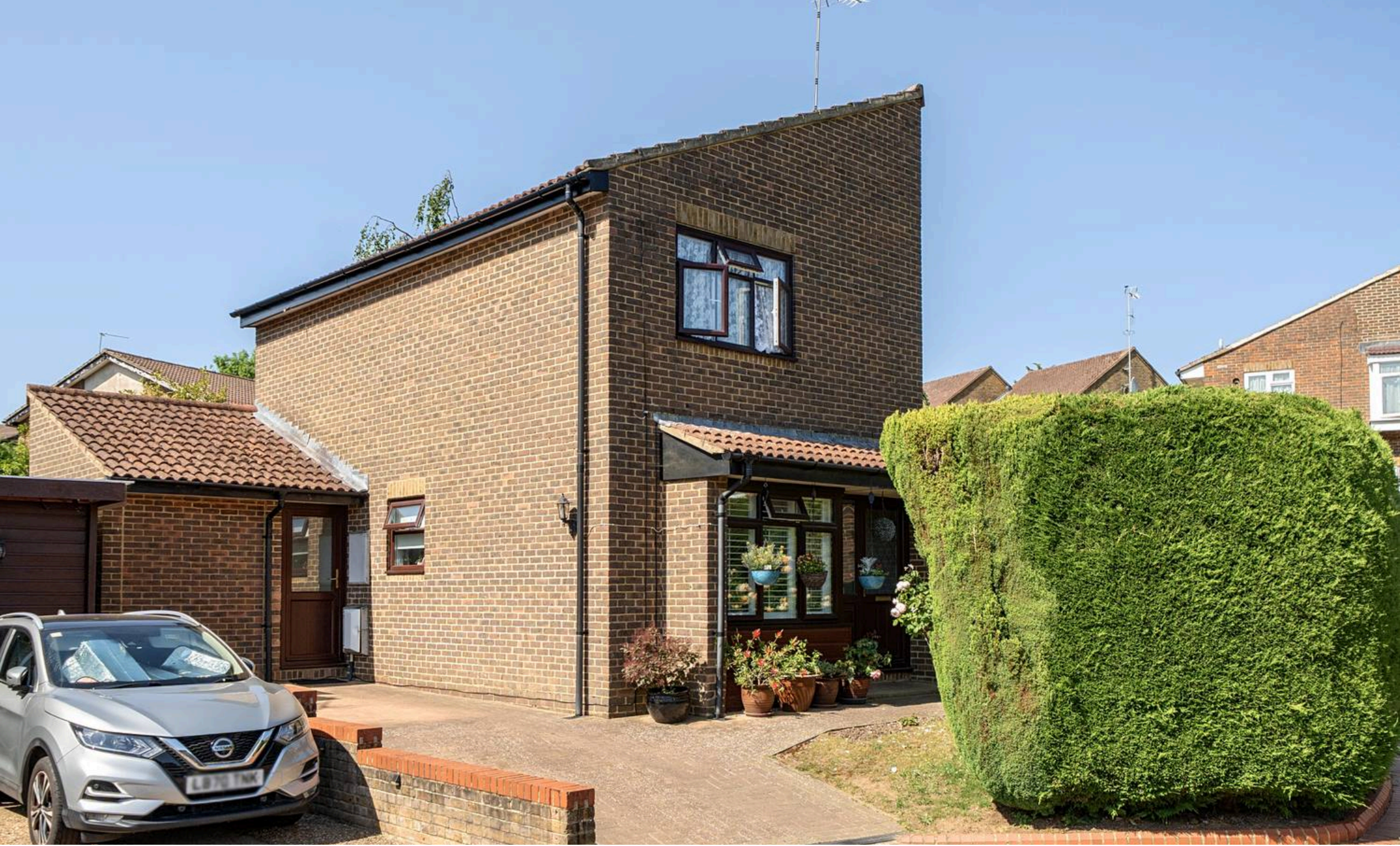
Allum Grove, Tadworth