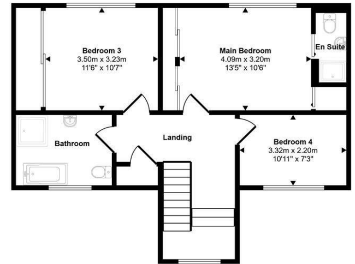
First Floor Approx 63 sq m / 673 sq ft