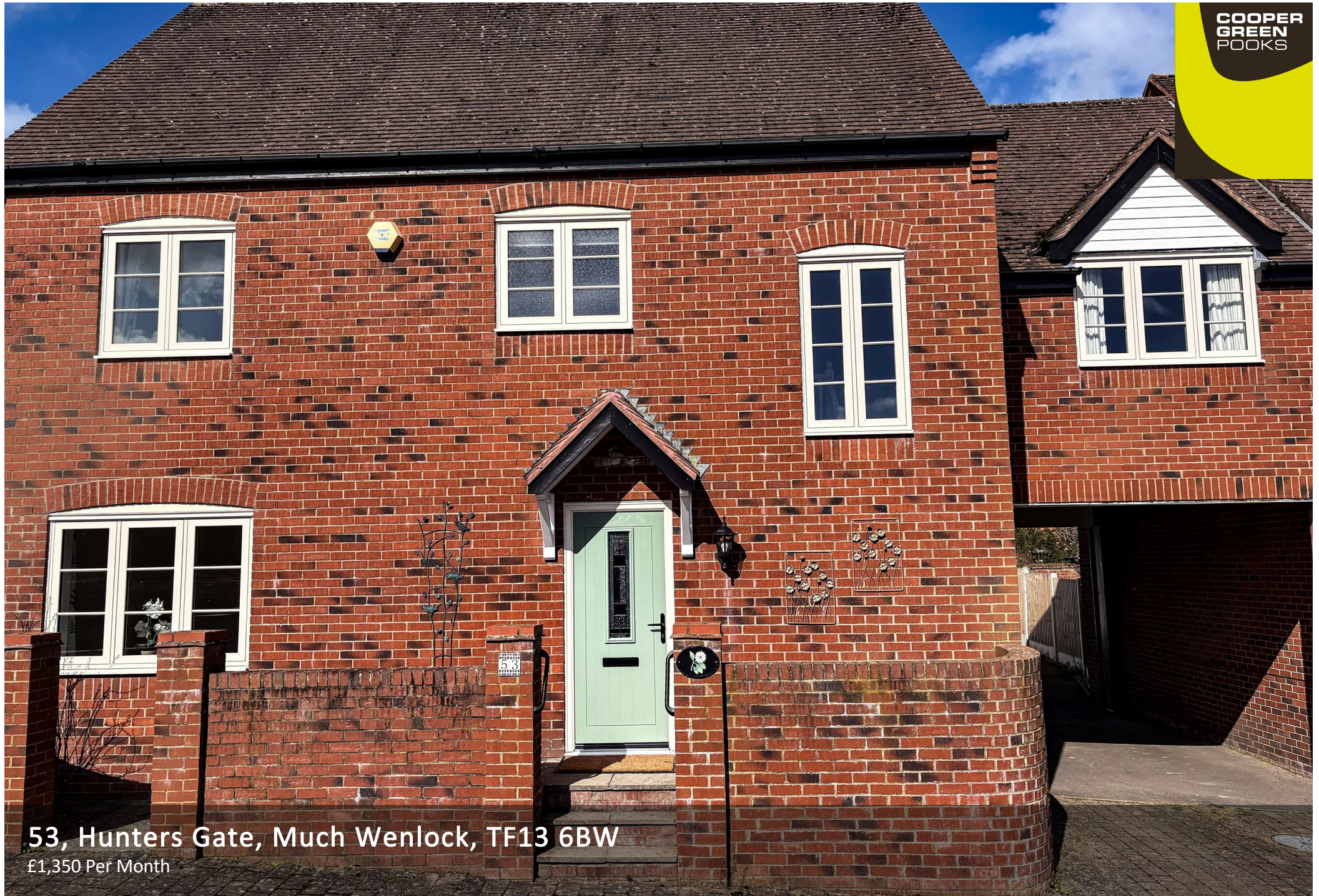
53, Hunters Gate, Much Wenlock, TF13 6BW £1,350 Per Month