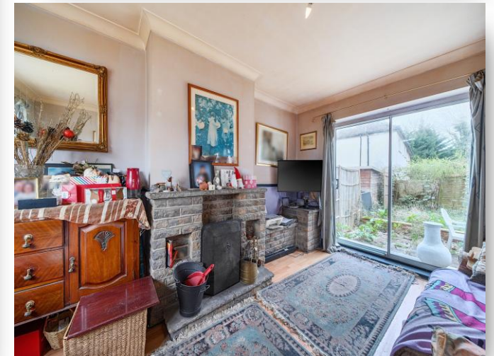
40 Desborough Crescent, Maidenhead SL6 4BB