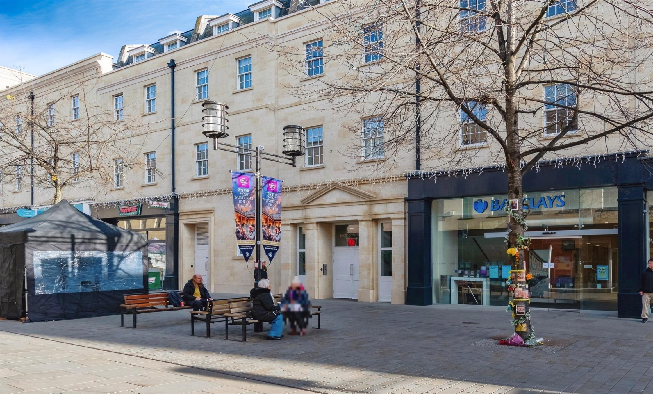
Southgate House Southgate Street, Bath BA1 1AQ