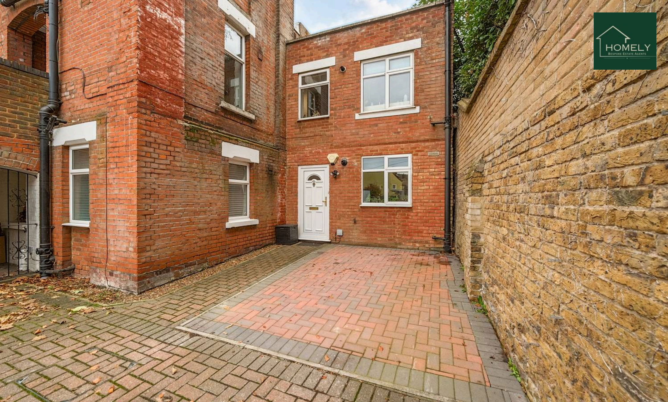
1 Dene Court, 189 Ufton Lane Sittingbourne