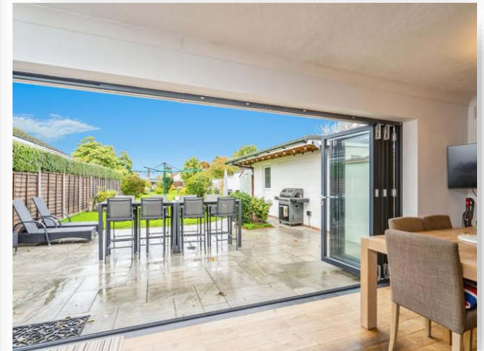
Rose Green Road, Bognor Regis PO21 3EP