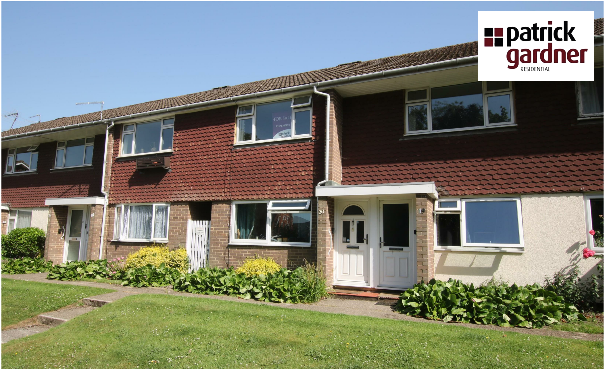
20 Windfield, Leatherhead, KT22 8UG