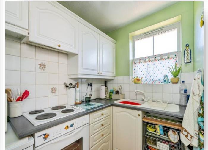
Levine Court Neville Road, Bognor Regis PO22 8BN