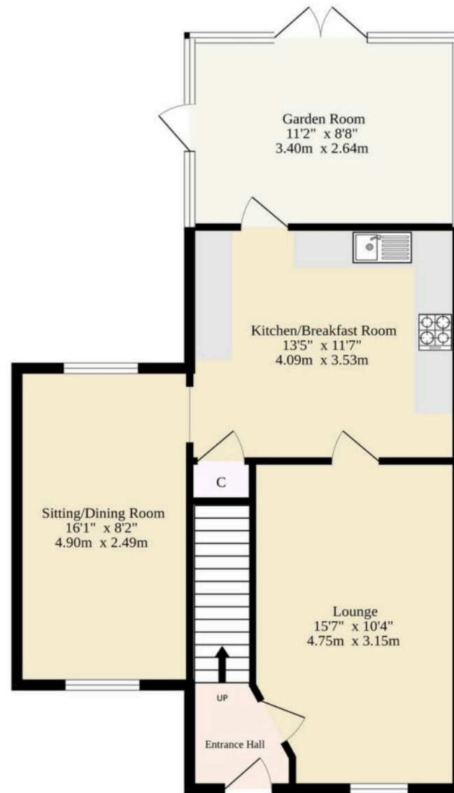
Ground Floor 573 sq.ft. (53.2 sq.m.) approx.