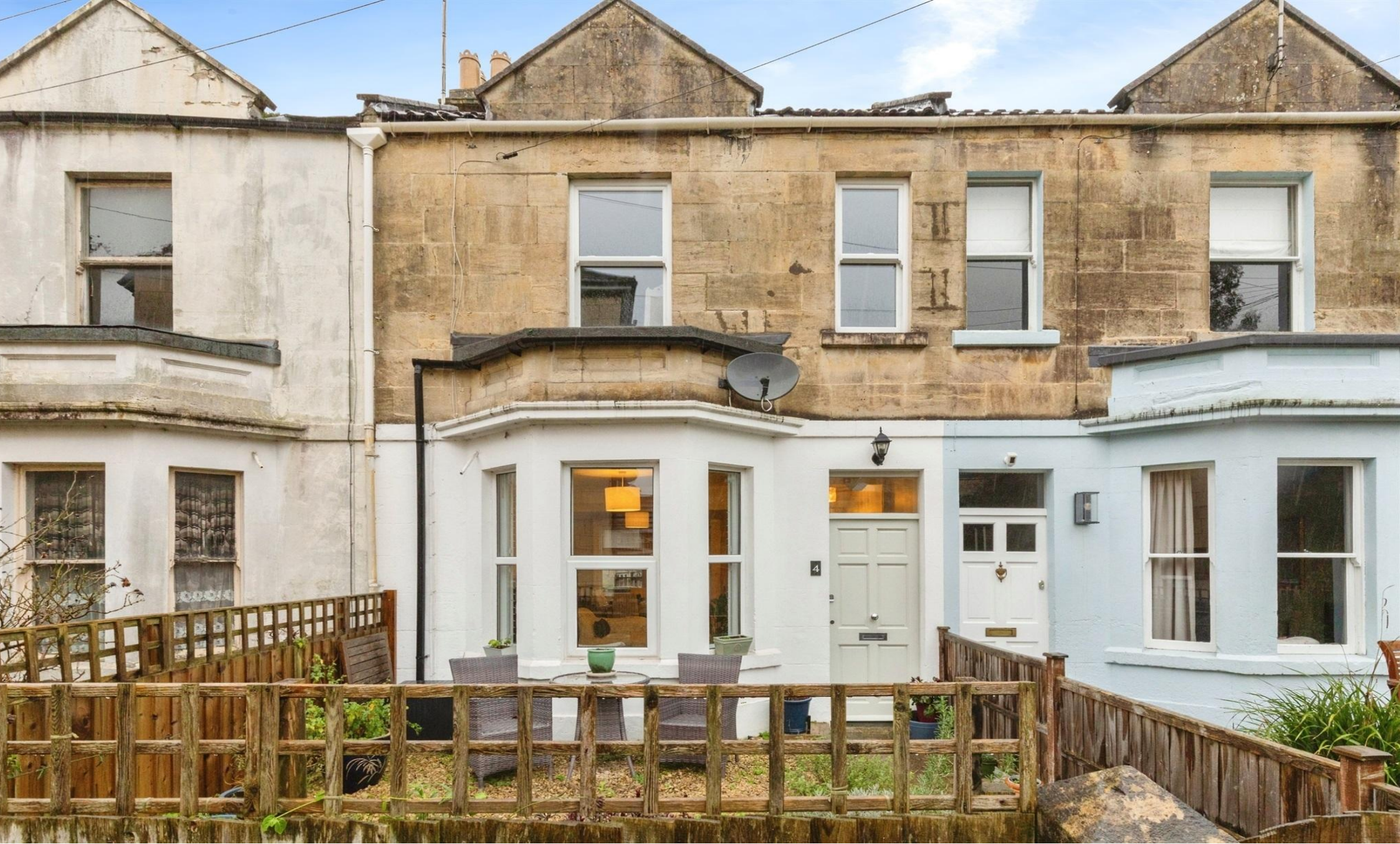
Prior Park Gardens, Bath BA2 4NQ