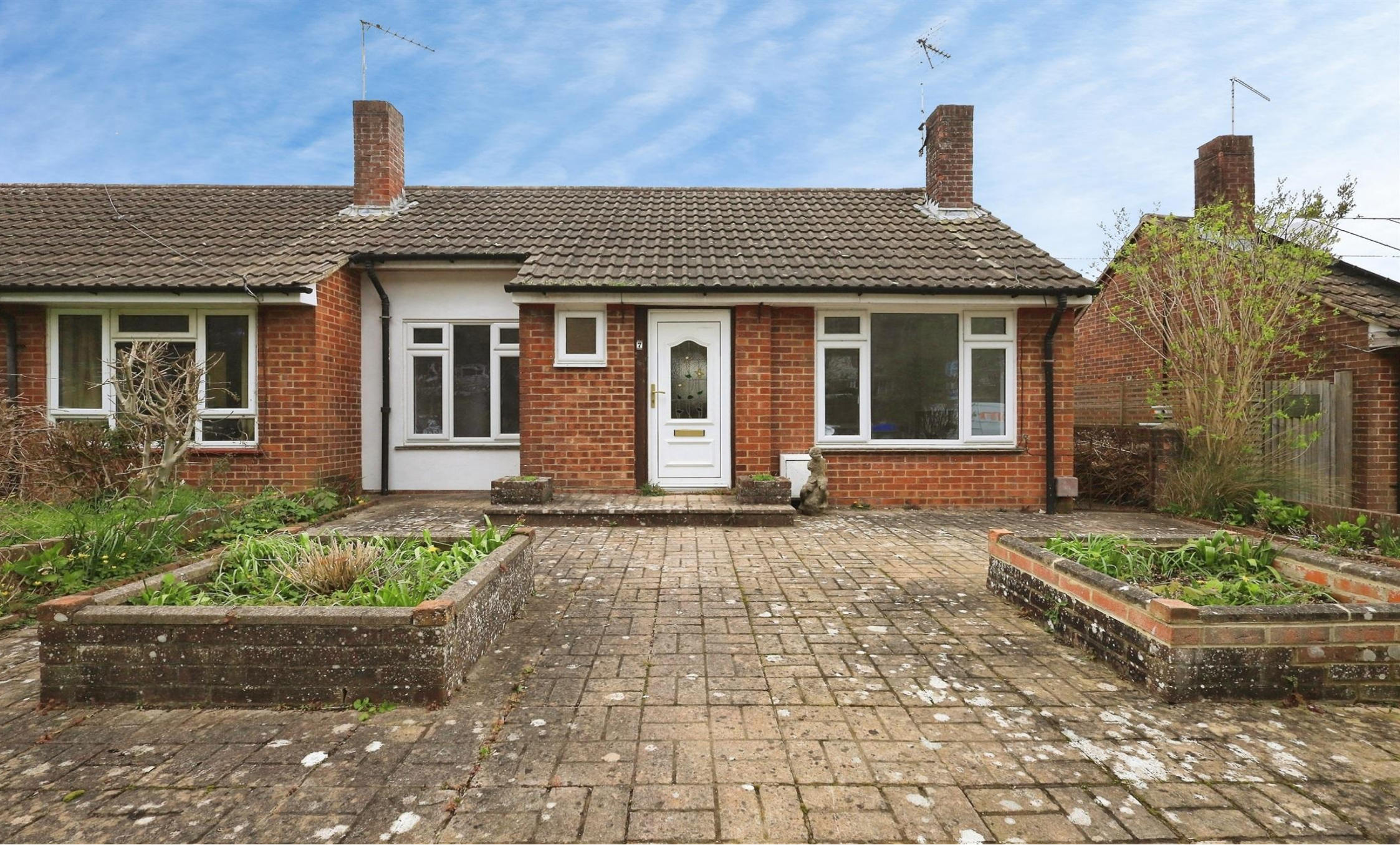
Winterbourne Lane, Lewes BN7 1HN