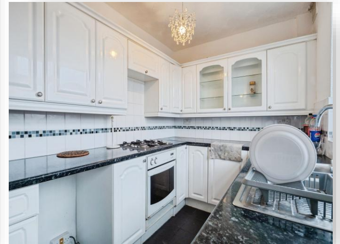
Waltham Avenue, LEICESTER LE3 1FD