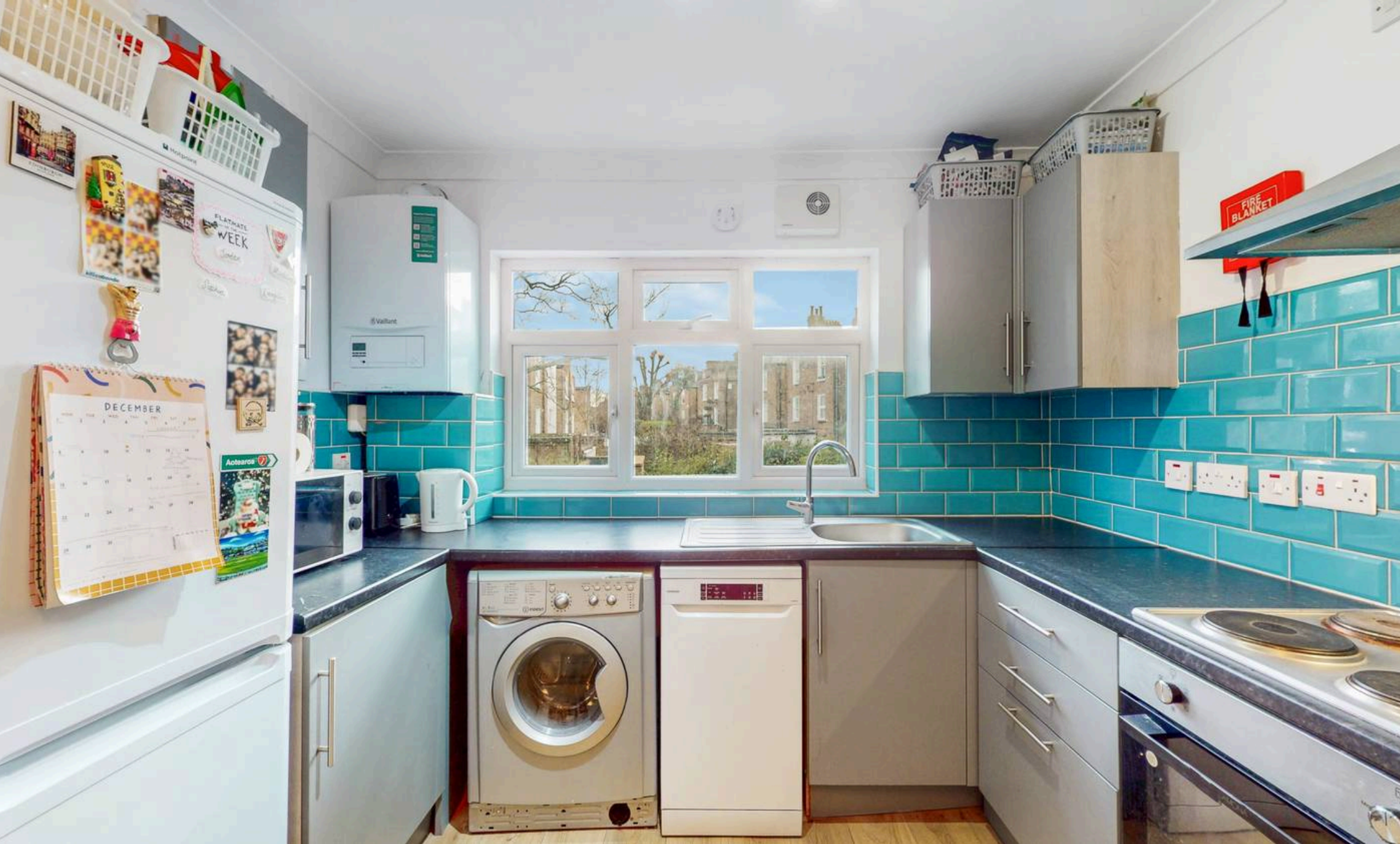
Kilburn Lane, London, W9 £3,100 pcm