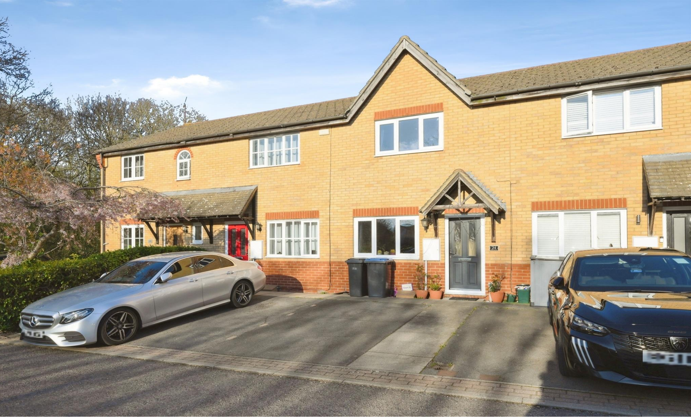
Denby Grange, HARLOW CM17 9PZ