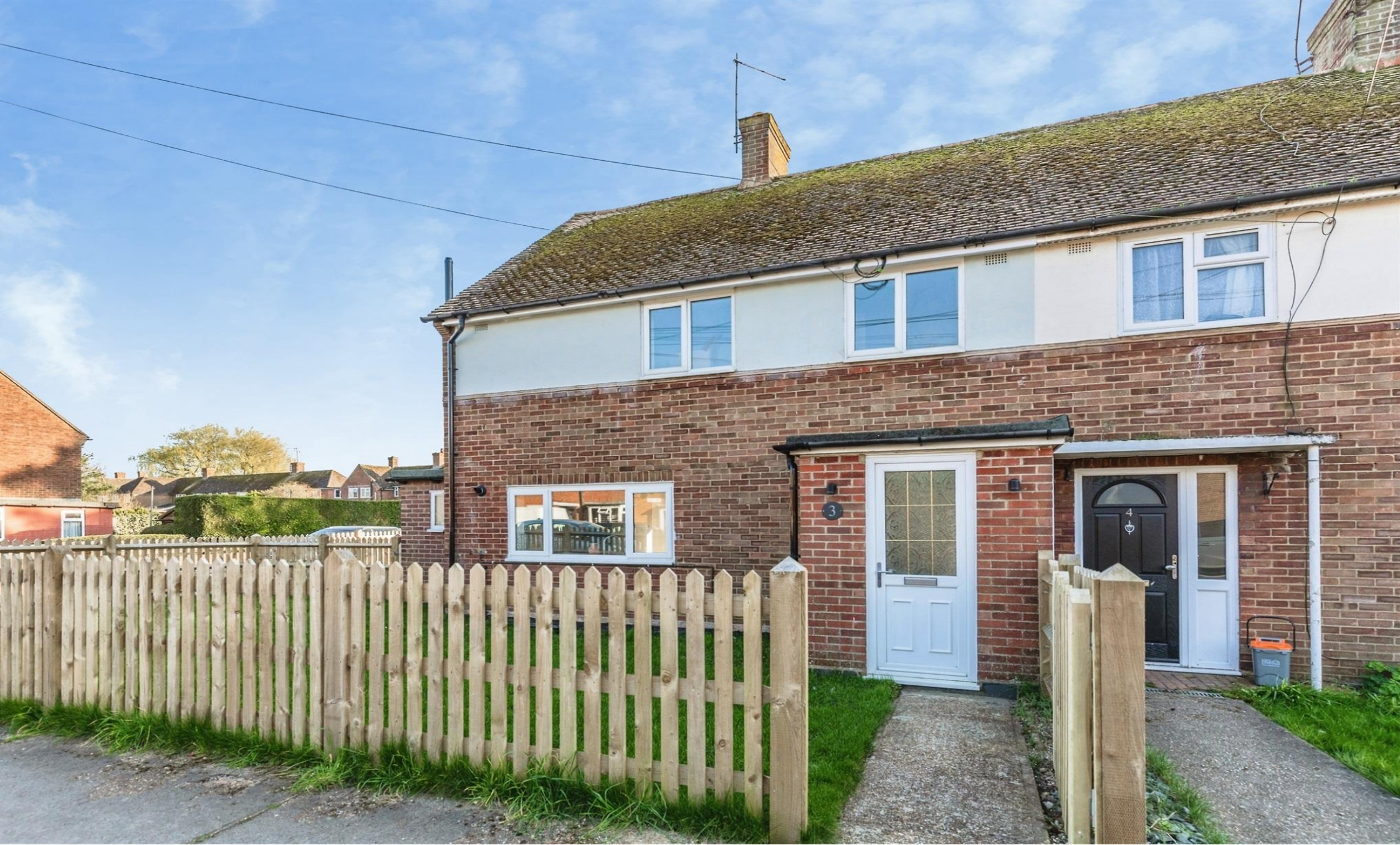
The Close, Rye TN31 7BS