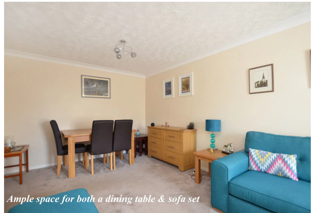
Ample space for both a dining table & sofa set