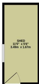
GROUND FLOOR 477 sq.ft. (44.3 sq.m.) approx.