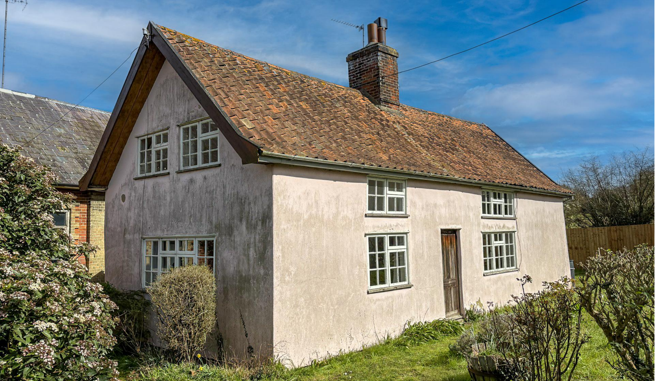
Victoria Cottage, Yoxford, Suffolk