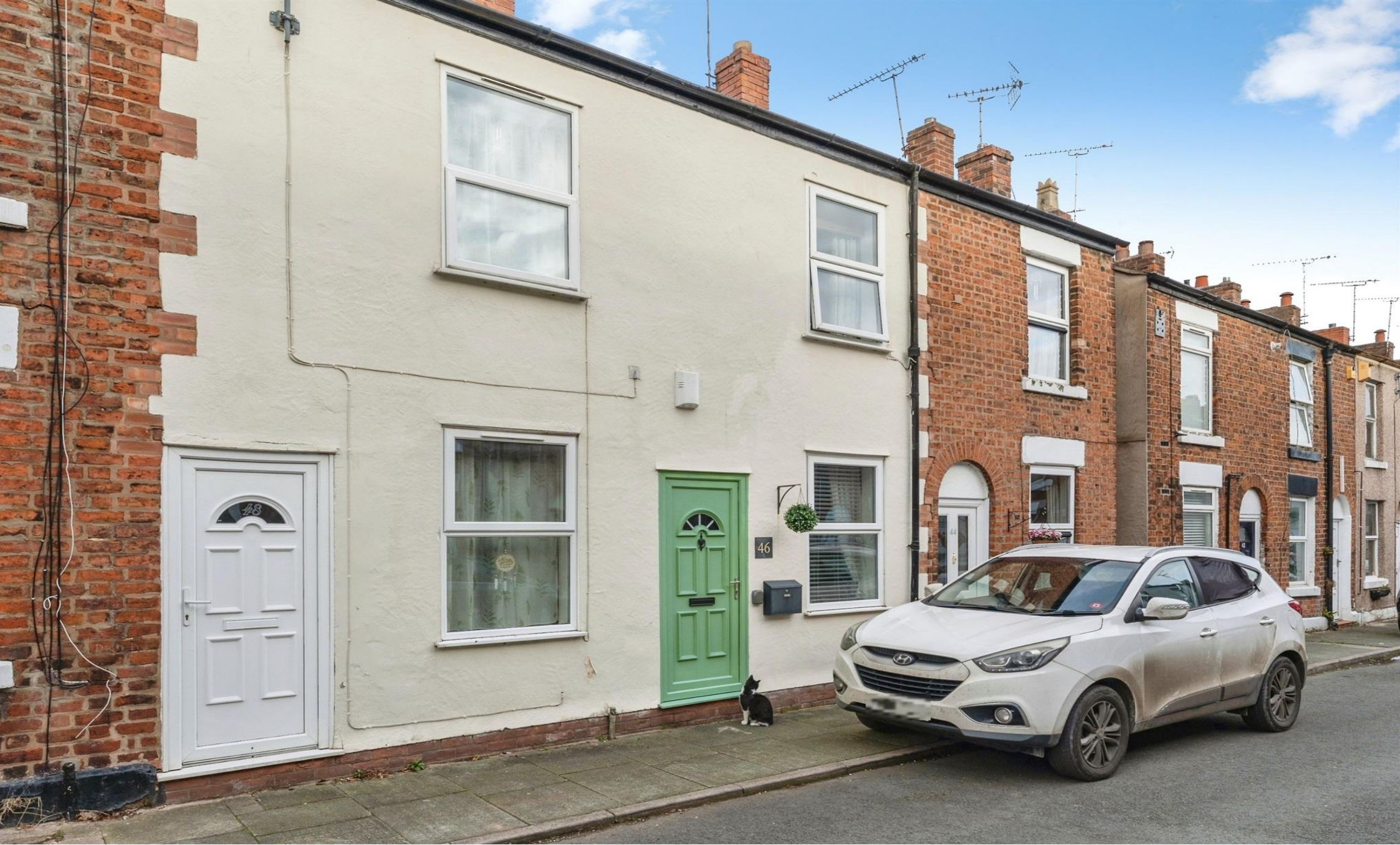
Gloucester Street, Chester CH1 3HR