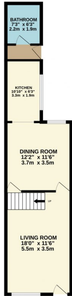
GROUND FLOOR 476 sq ft. (44.2 sq m.) approx.