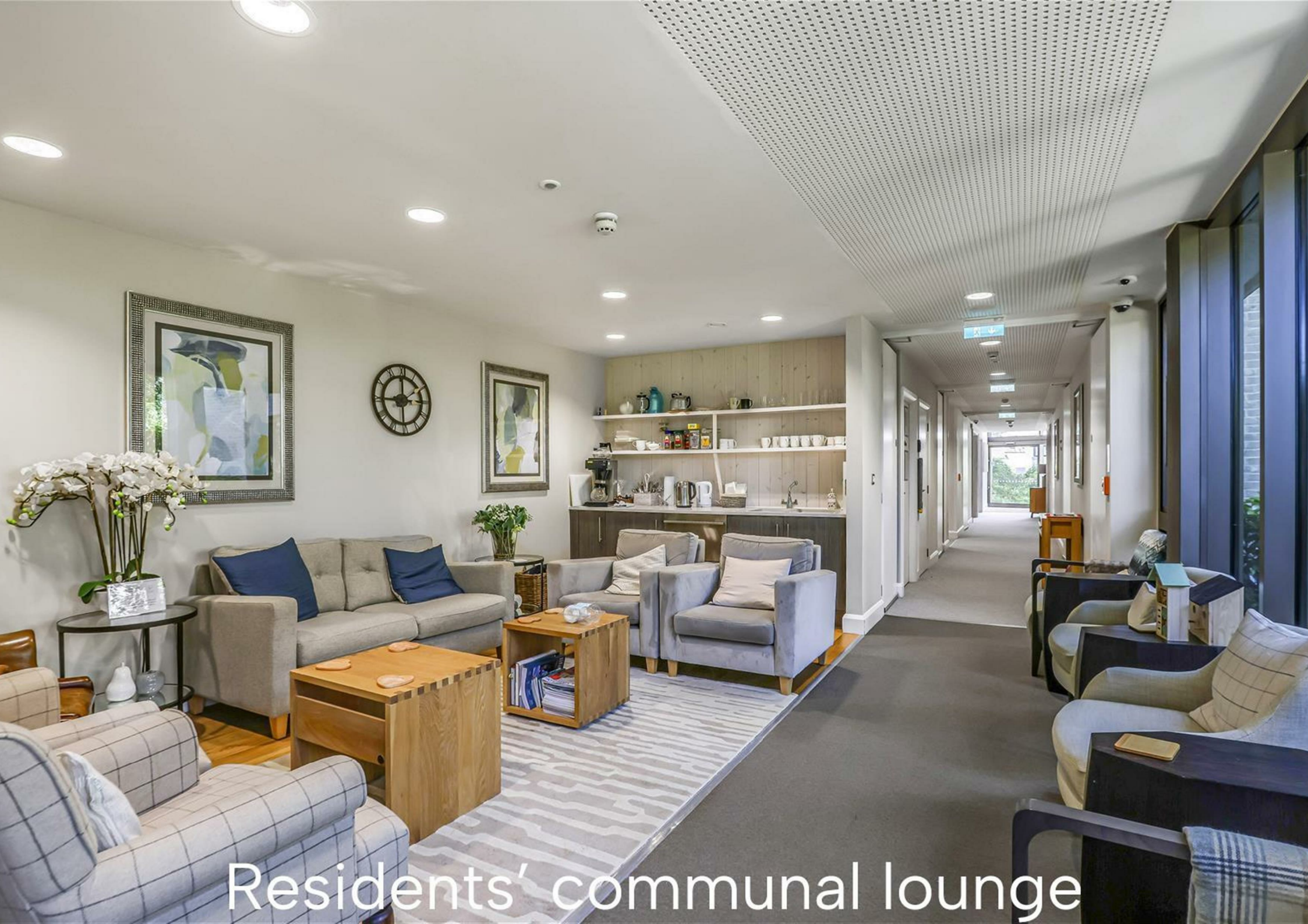
Residents' communal lounge