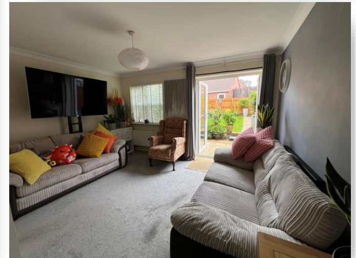
Temple Gardens, RUSHDEN NN10 0GN