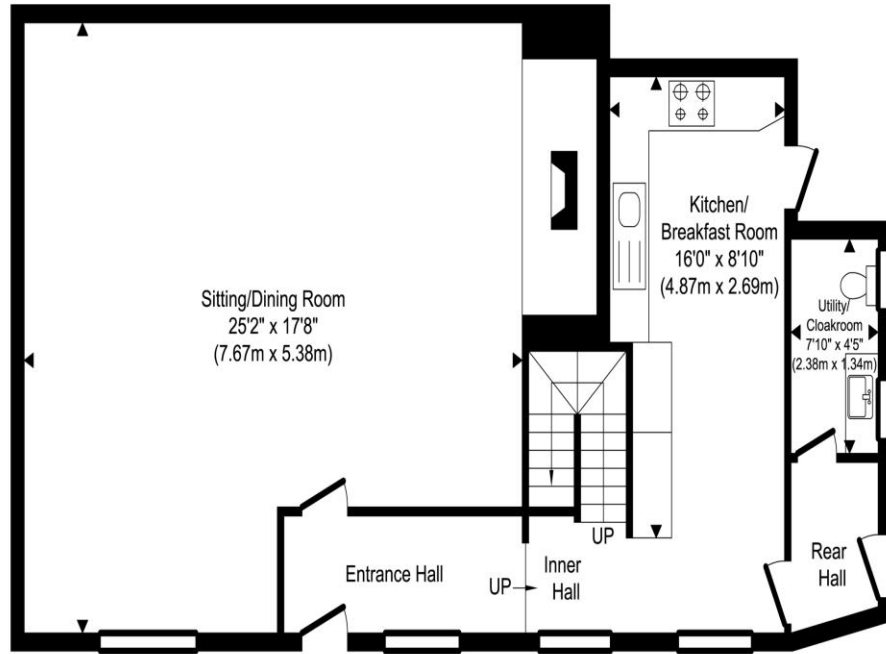
Ground Floor Approximate Floor Area 896.63 sq. ft. (83.30 sq. m)